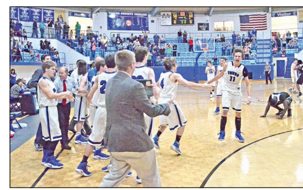
As the final buzzer sounds, the Indians celebrate their first State playoff victory in 43 years.